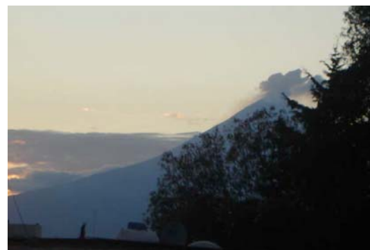
The Pyramid of Cholula